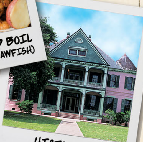
HISTORIC PLANTATION HOMES

FETES & FAIS DO DOS LIVE CAJUN MUSIC PLANTATION HOMES CAJUN DANCEHALLS CAJUN COOKING MARDI GRAS