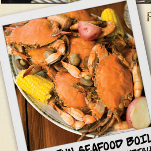
A CAJUN SEAFOOD BOIL (CRABS, SHRIMP & CRAWFISH)

Visit Houma, Louisiana and experience "Cajunicity" – the joie de vivre, or love for life that's ingrained into every aspect of our culture, community, history and heritage. You'll see it reflected in our distinctive Cajun architecture and art and learn about its extraordinary 300 year history at our engaging museums and historical sites. You'll encounter it at boisterous festivals, fetes, fais do dos and celebrate it at our two-week Mardi Gras celebration. You'll also hear it in our colorful Cajun language and lively music and taste its rich and uncommon flavors in our world-famous cooking.